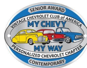
Sample Award Tab

The Personalized Chevrolet Chapter (PCC) currently provides two levels of certification. Vehicles scoring 901 to 950 points are granted a Junior award and vehicles scoring over 950 points (951 – 1000) are granted a Senior award. The winner of a Junior or Senior award would receive a tab displaying the award and the class 2 . The tab would be affixed to the rear of the PCC grille badge. The award portion of the tab protrudes above the grille badge where the Junior or Senior Award will be visible. The class portion of the tab protrudes below the grille badge where the Contemporary, Modified, Custom or Sleeper class will be visible.